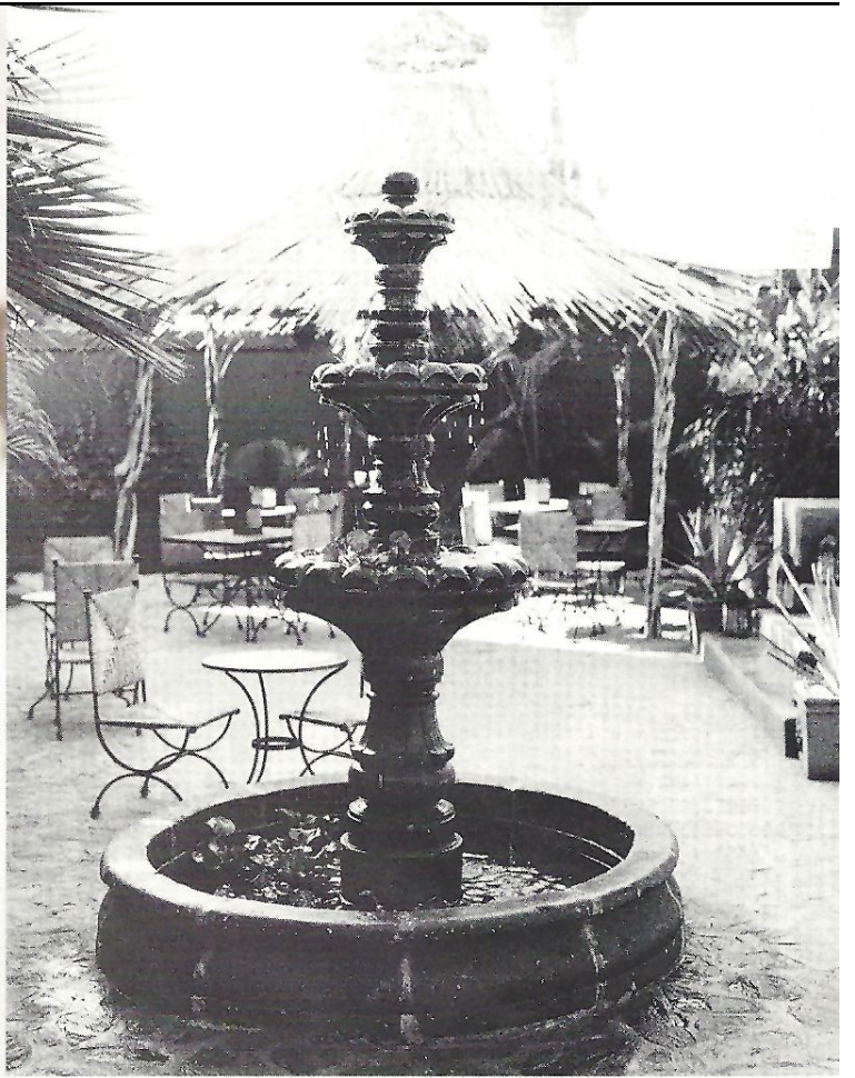
Marinated parrot fish on squash, at the Restaurant at Esperanza. Clockwise from above: the Esperanza spa's agua fresca drink; the fountained courtyard of the Hotel California, in Todos Santos; navigating El Arco.